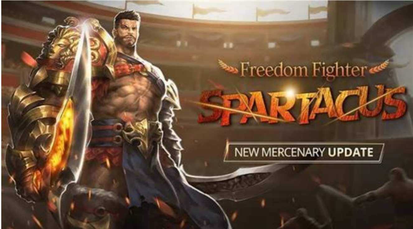
Atlantica online mercenary. Atlantica online guide.